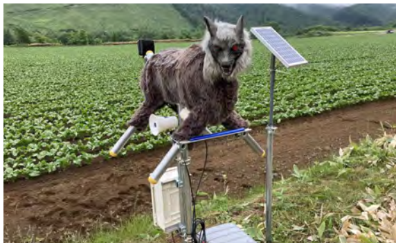
MONSTER WOLF keeping watch over a beet field (Bihoro Town, Hokkaido)

Modeled after the wolf—a natural enemy of many wild animals (including deer, bears, and wild boars)—MONSTER WOLF takes advantage of animals' natural tendency to sense danger and stay away.