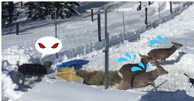
Testing at a university's deer breeding ground (Abashiri City, Hokkaido)